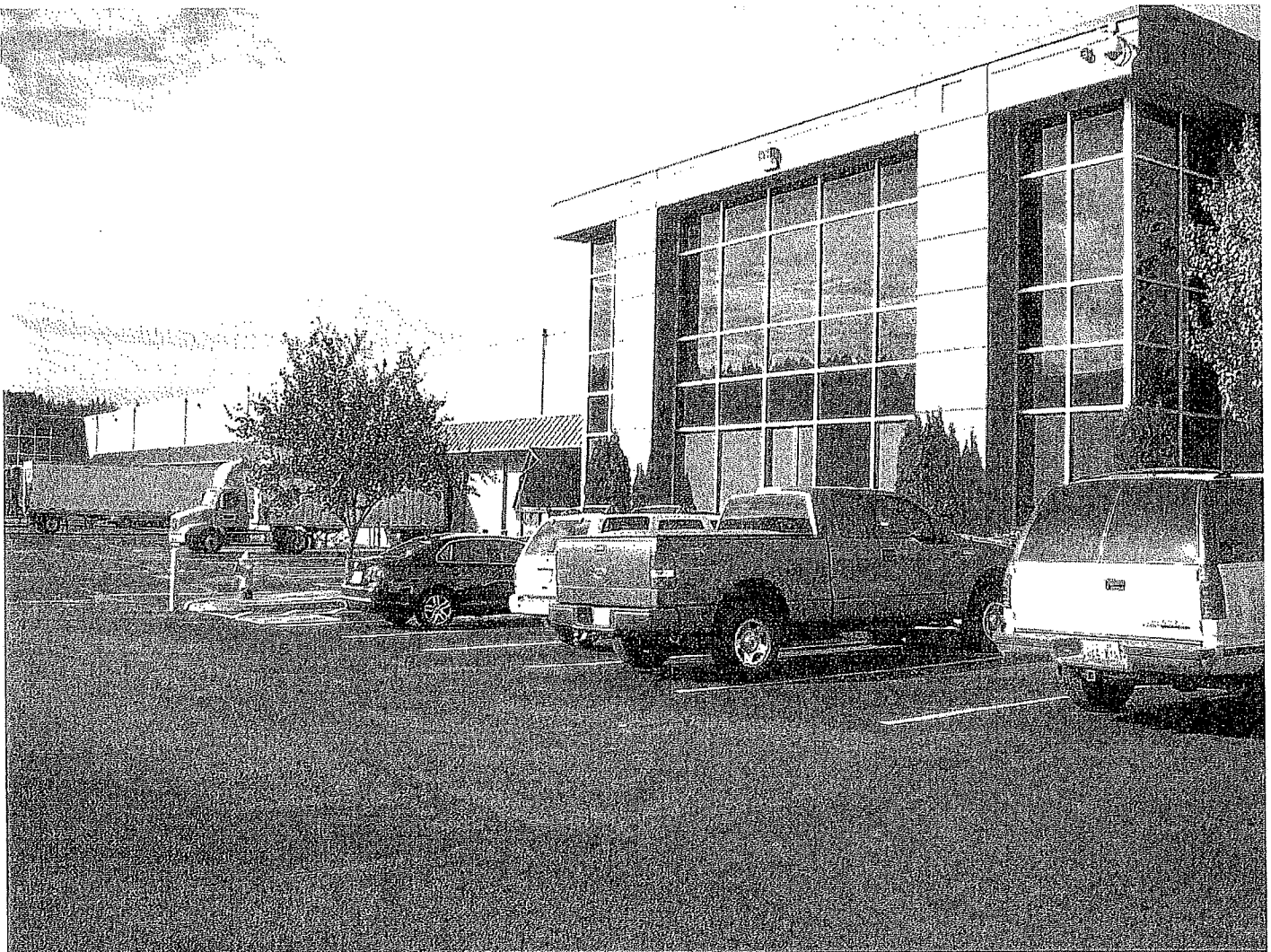
Front View: Taken 10/13/09

If using the Elevation Certificate to obtain NFIP flood insurance, affix at least two building photographs below according to the instructions for Item A6. Identify all photographs with: date taken; "Front View" and "Rear View"; and, if required, "Right Side View" and "Left Side View." If submitting more photographs than will fit on this page, use the Continuation Page, following.